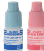
CLEARFIL™ NEW BOND