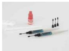
TEETHMATE™ F-1 2.0