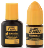
CLEARFIL™ SE BOND 2