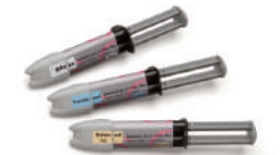
PANAVIA™ SA LUTING Plus