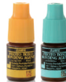
CLEARFIL™ PHOTO BOND