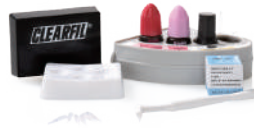
CLEARFIL™ LINER BOND 2V